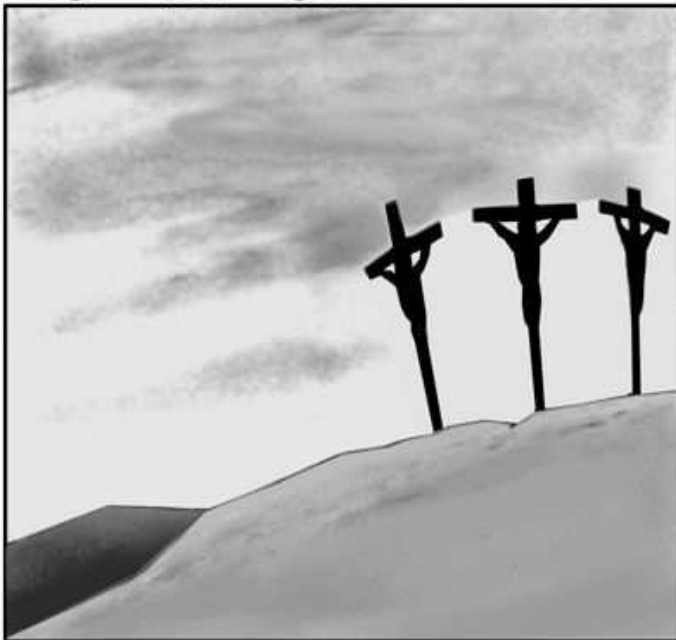
GOLGOTHA - The hill of redemption where Christ shed his blood for our sins. Mt 27:33