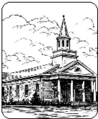
Wilburton First United Methodist Church

P.O. Box 6 207 East Ada Wilburton, OK 74578 Phone: 918.465.3322 E-mail: wilburtonfumc@sbcglobal.net