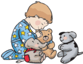
God Hears and Answers Prayers