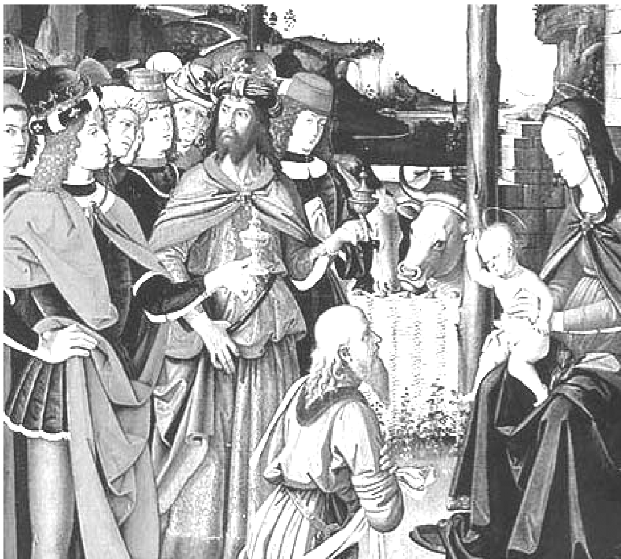
Adoration of the Magi - Perugino

December 1, 6:00 P.M.—Advent Event # 1 December 8, 6:00 P.M.—Advent Event # 2