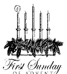
First Sunday OF ADVENT November 29