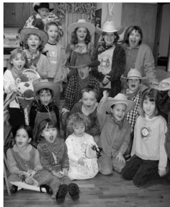
Club Wild West at Moundville UMC

Community awareness of the Moundville United Methodist Church as an active and vital organization has increased thanks to its efforts in serving the community with Christian worship, education, mission involvement and social life. There are more events and programming to which people can be invited, and these events often receive publicity in the local newspaper, essentially providing free advertising for the church. The additional ministries even enabled the Moundville congregation to exceed the necessary credits for its Welcoming Congregation Certification through United Methodist Communication's Igniting Ministry Campaign, and three consecutive years of achieving that designation further challenges the congregation to live up to being both welcoming and inviting to those in the community and beyond. One small effort led to other efforts, all with encouraging results. Thanks to the particular strengths of the congregation and in spite of its particular weaknesses, outreach was within reach. Small churches do face increasing challenges, but even during this age of mega churches and the public desire for supersizing, small churches can still continue to do good works and have a positive impact in their communities.