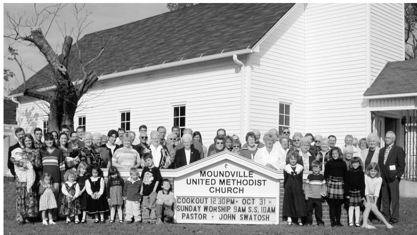
The congregation at Moundville UMC gather for a photo before the cookout.

After nearly a year of offering Children's Church, in addition to making an increased effort promoting its annual Vacation Bible School, the congregation was able to identify a core group of 10 youth as potential members of a youth program, and began to revisit what it could do for those youth. In the fall of 2003, volunteers from the congregation developed and presented a proposal to the Administrative Council that the church sponsor and fund Pioneer Clubs, a Bible-based club format with elements similar to the Boy and Girl Scouts. The council approved the proposal at its December 2003 meeting as a means by which to continue celebrating the congregation's 120 th year of