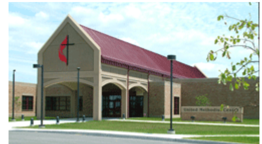
Illinois Great Rivers Conference and Garrett-Evangelical Theological Seminary