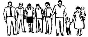
FUMC PRAYER LIST