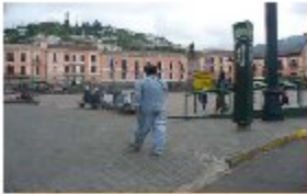
Quito: The Colonial City