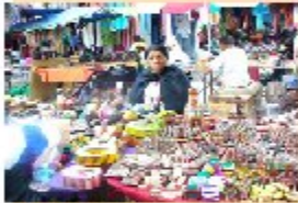
Market in Otavalo