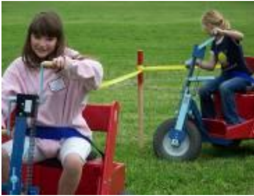
trying out P.E.T. vehicles