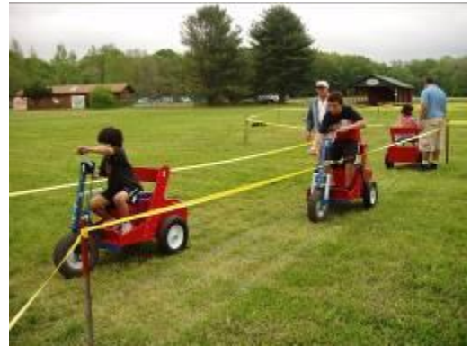
P.E.T. obstacle course