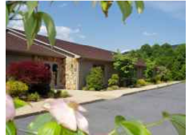
Blessings Lodge at Camp Overlook

Single Again will be hosted at the Blessings Lodge. Nestled on the side of Massanutten Mountain, it overlooks the Shenandoah Valley and reminds one of God's creative, sustaining presence. Participants will stay in semi-private rooms with private baths.